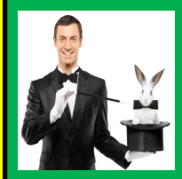
Classics Of Magic